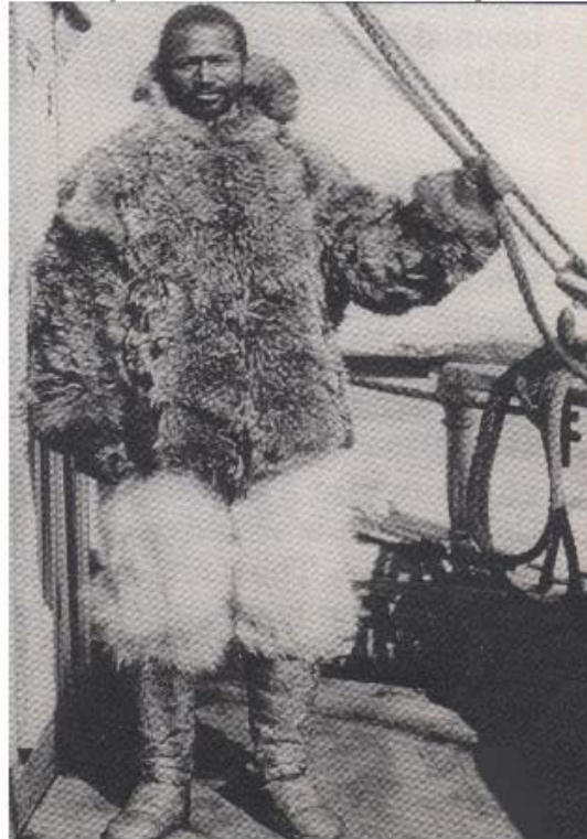
"A GREAT EXPLORER"