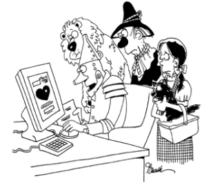
"You guys go ahead. I think I've found something here on ebay."