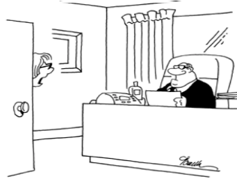
"Your wife called to remind you that she still exists."

In our time, Valentine cards abound. Kids send them to classmates. Sweethearts send sentimental or funny cards to each other, and just about anyone can send a Valentine that is friendly or humorous to a friend, relative, or co-worker.