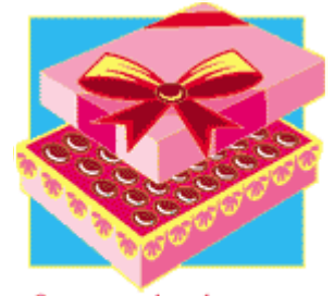
Sweet wishes for a Happy Valentine's Day